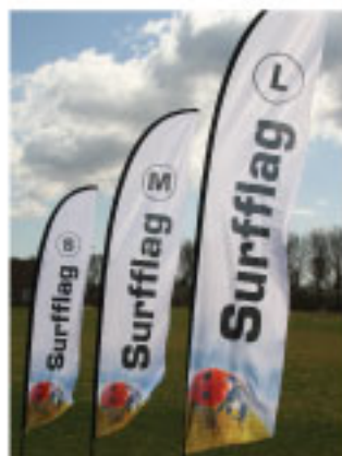
Surfflag is available in three sizes.