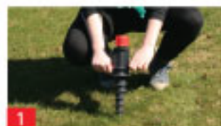
1 Screw the base into the ground.