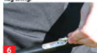
6 Attached the hook, located at the bottom of the flag, to the bracket on the pole.