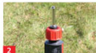
2 Connect the rotator.