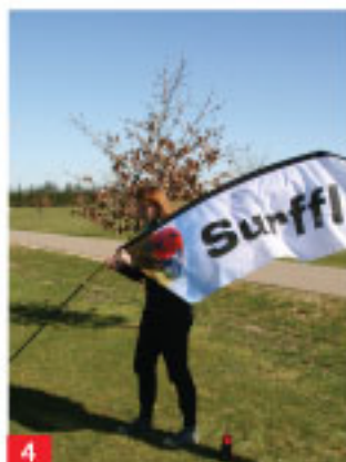
4 Pull the flag on to the pole.