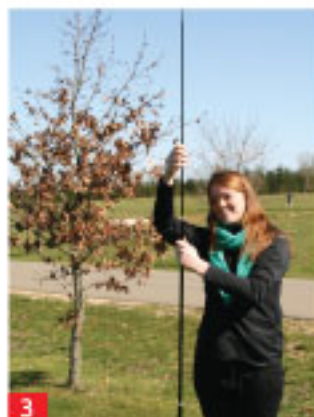
3 Connect the 4 parts of the pole.