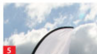
5 Make sure the tip of the pole is pushed all the way to the end of the flag lining.